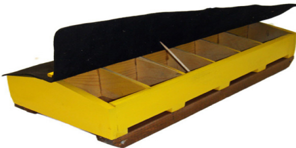
"Low Boy" 12-Hole Wooden Feeder Item no. B001 Space for 12 different items