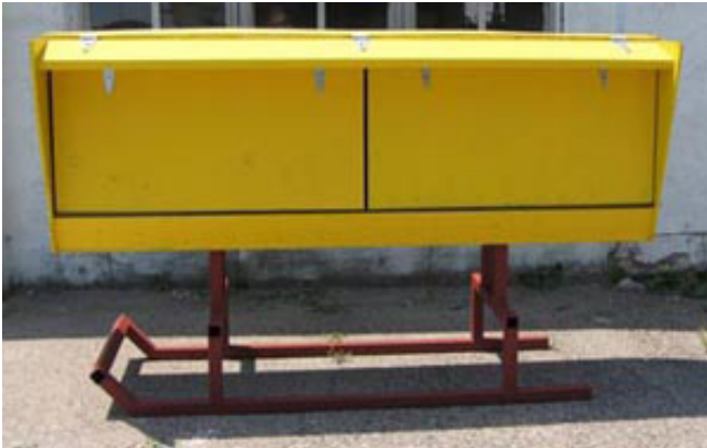
7-hole or 14-hole feeder (PLANS ONLY)

Most farmers probably wouldn't think much of a mechanic that tried to overhaul a tractor with a screwdriver, a pair of pliers and a couple of crescent wrenches. Unfortunately, in their role as animal caretakers, some livestock men seem to think that a cheap sack of high calcium minerals and a trace mineral salt block are all the tools needed by our livestock to fully utilize the energy stored in our feeds. They are wrong!