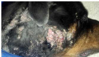
Before Pro Bi