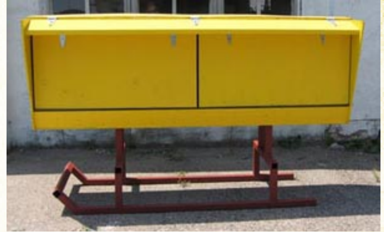
7-Hole or 14-Hole Feeder (Plans Only)

These feeders make it easy to feed various minerals.