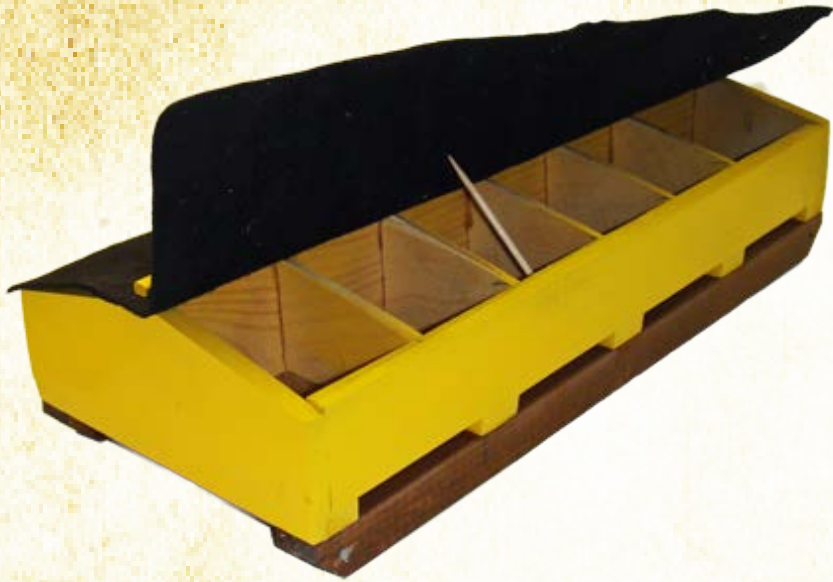
12 Stones “Low Boy” 12-Hole Mineral Feeder Item Number: B001